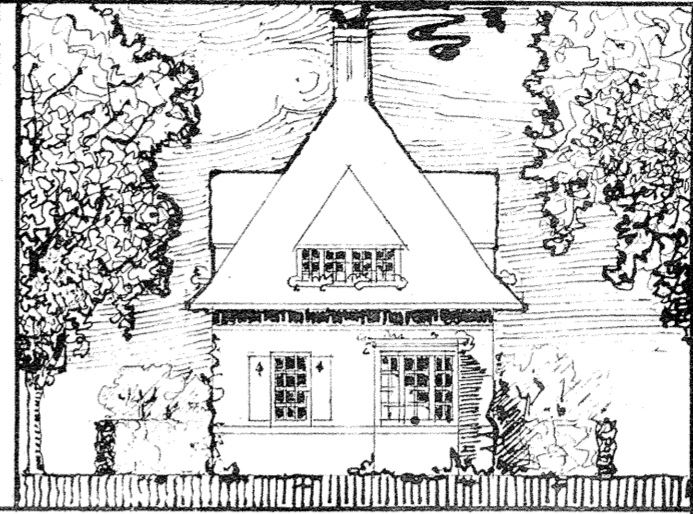
SCHETS VOORGEVEL. SCHAAL 1:200. 0 5